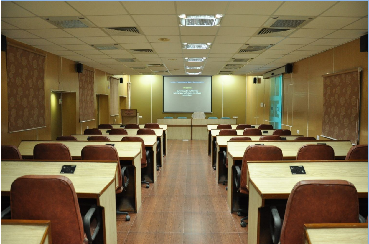
View of new Training Hall