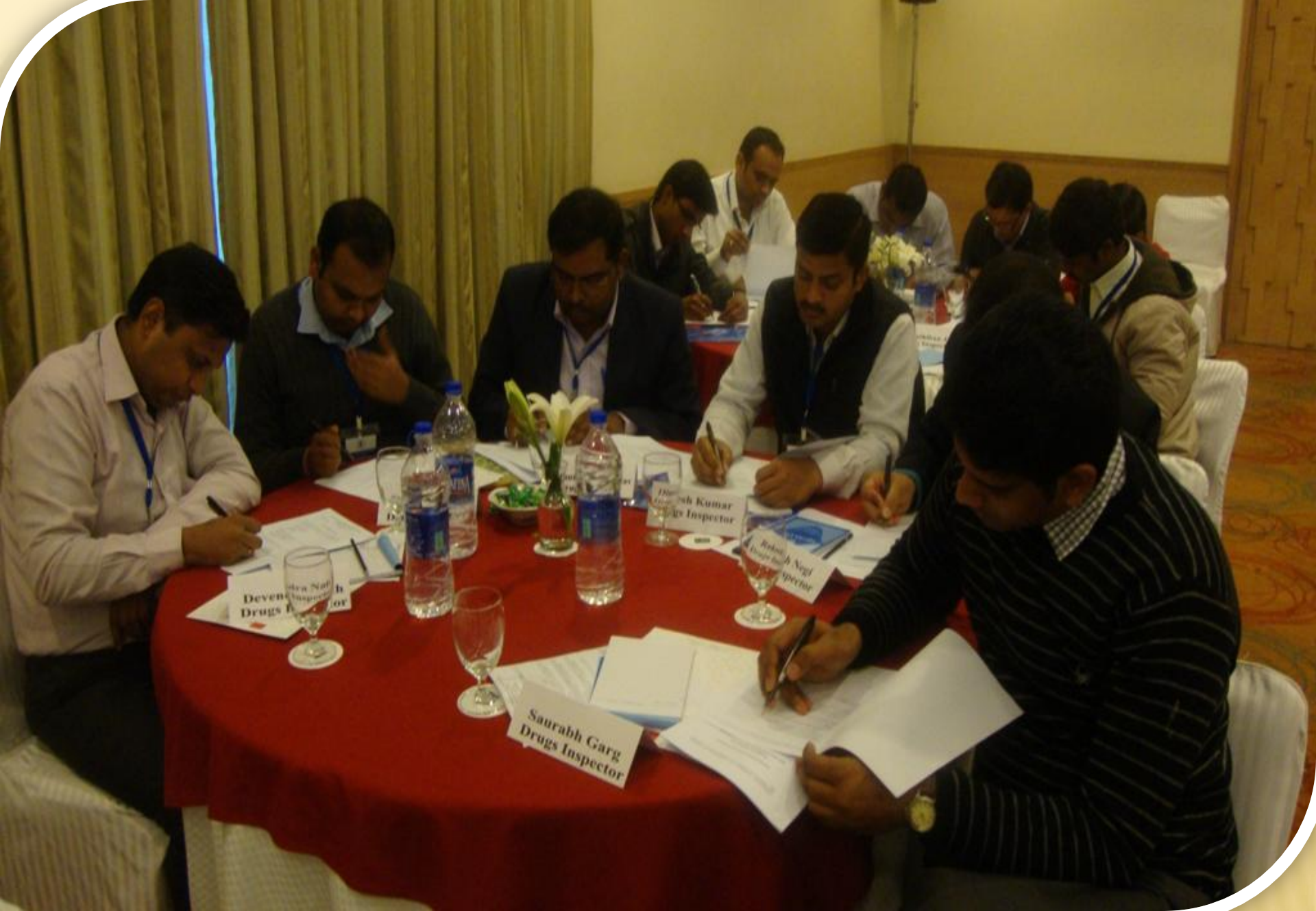
PRE-ASSESSMENT OF THE PARTICIPANTS AT THE BEGINNING OF THE WORKSHOP