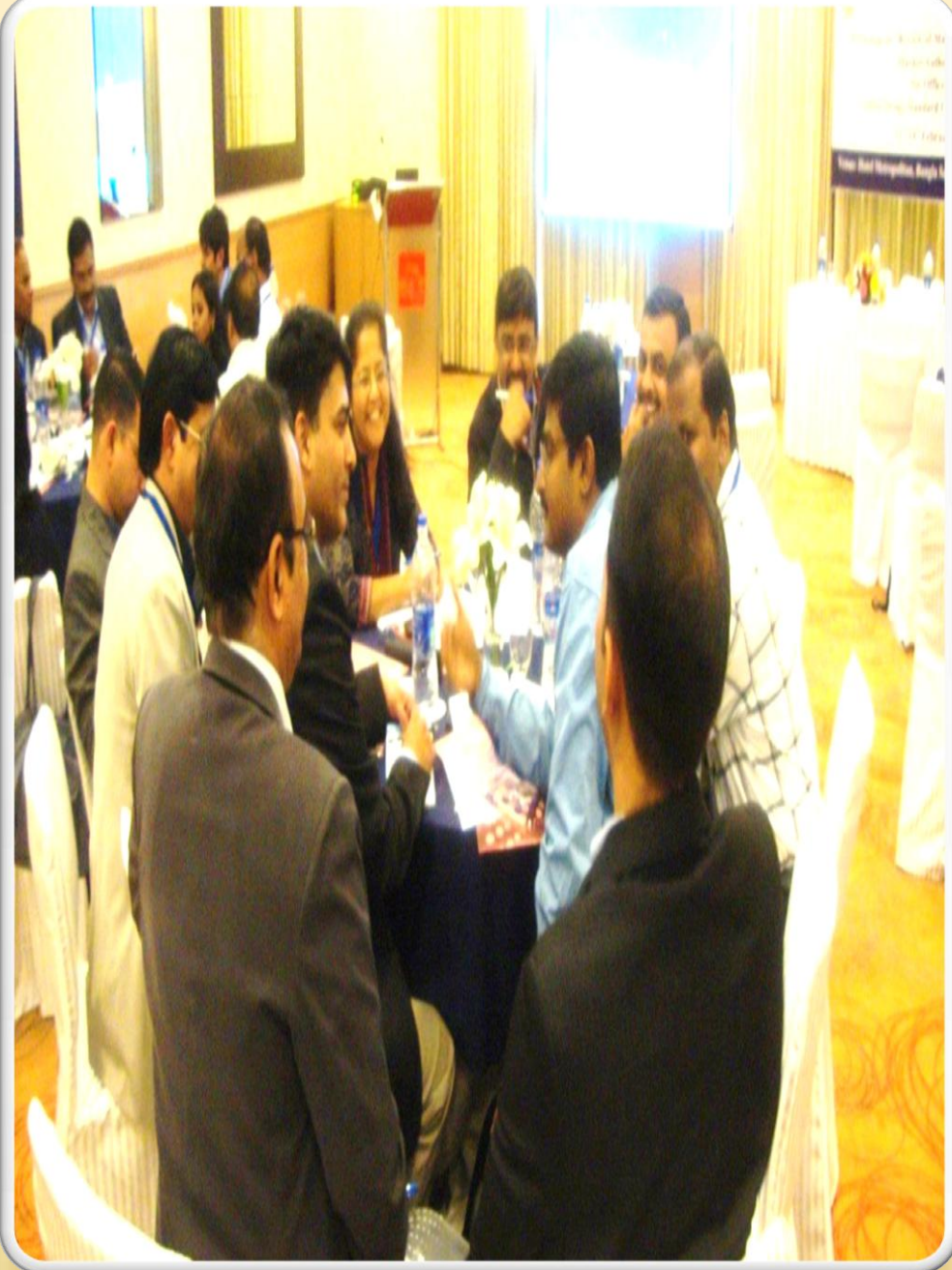
GROUP DISCUSSION ON CASE STUDY