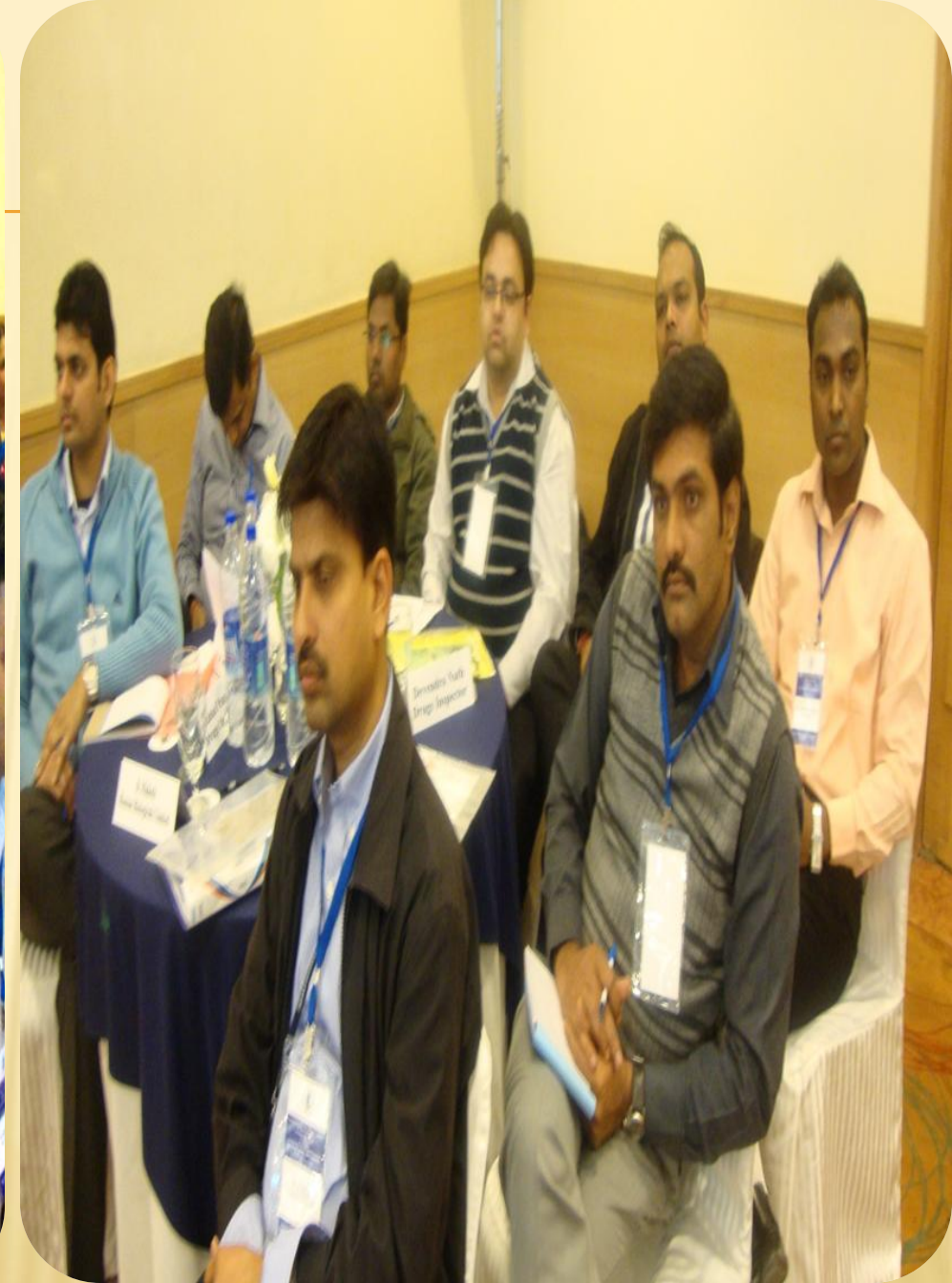
FACILITATORS AND PARTICIPANTS TAKING KEEN INTEREST DURING THE PRESENTATIONS