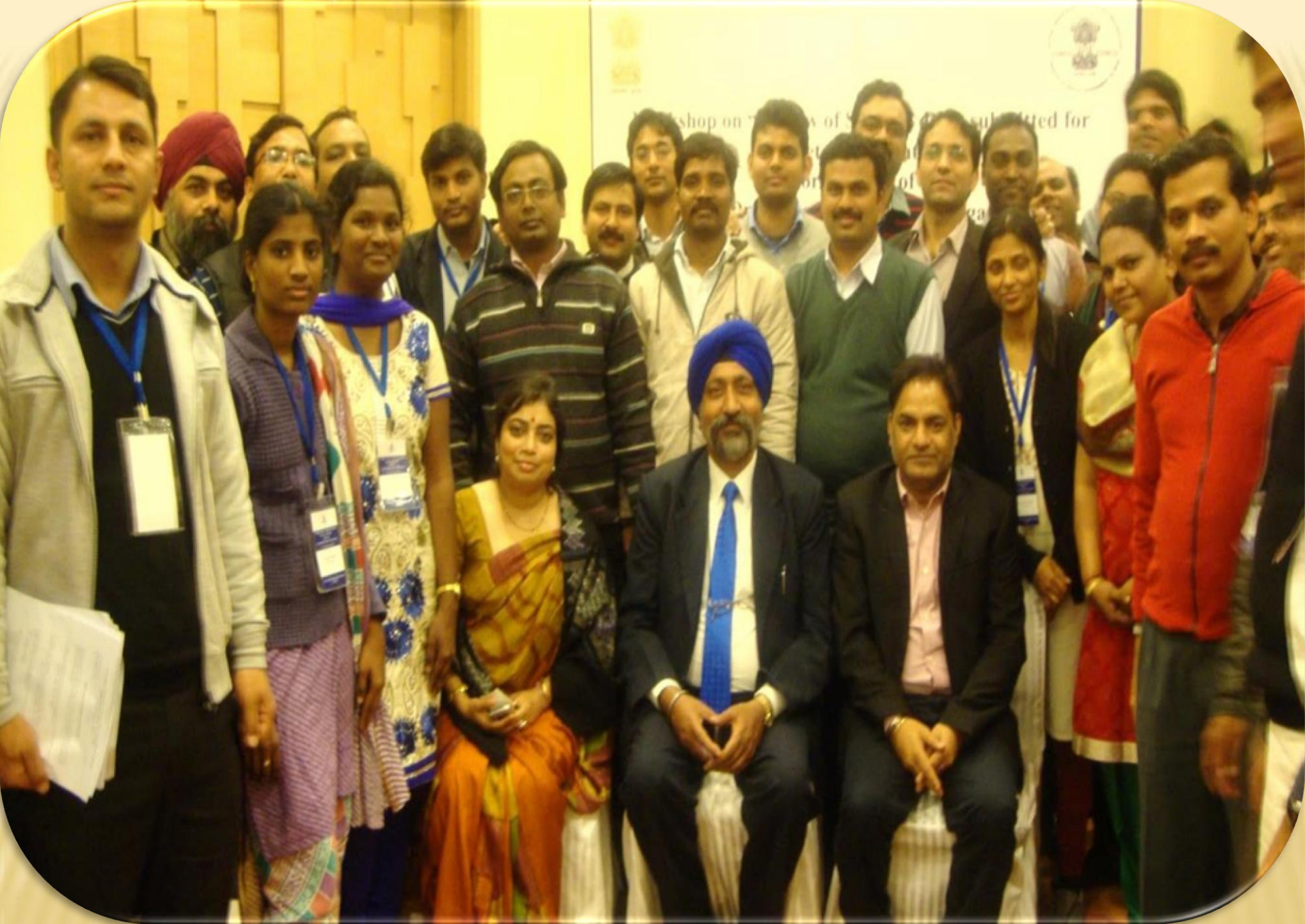
Participants for workshop