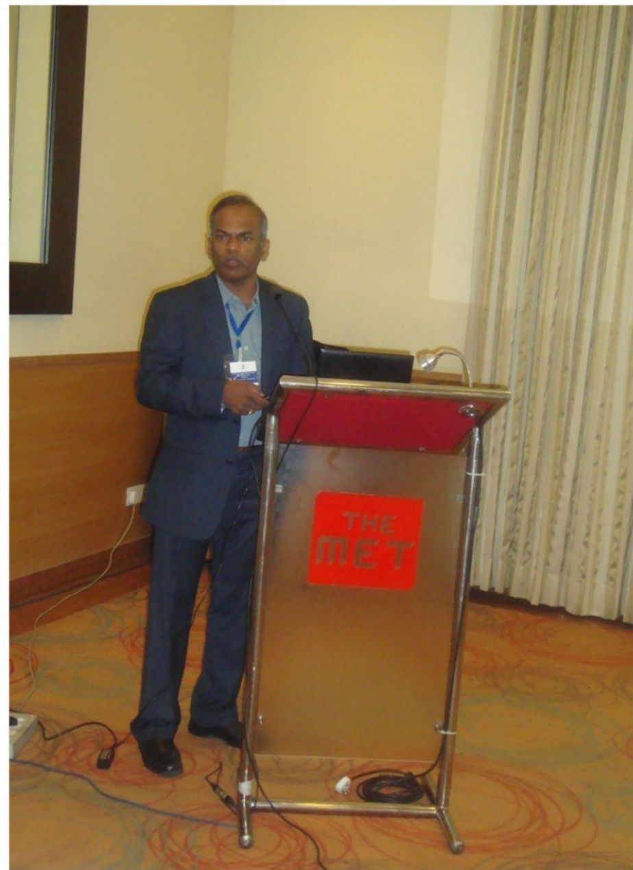
PRESENTATIONS ON STABILITY STUDIES BY DIFFERENT PHARMACEUTICAL MANUFACTURERS